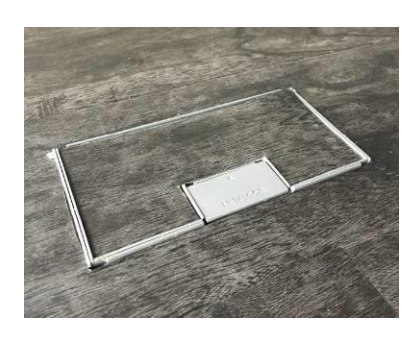
For Plug Type A/B